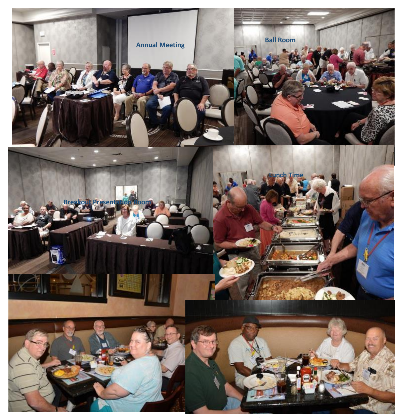
Friday Evening Dinner in the Grand Cafe