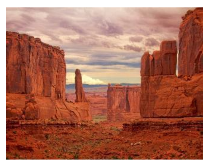
1<sup>st</sup> Place Travel Arches National Park JB Burke, Prescott Computer Society