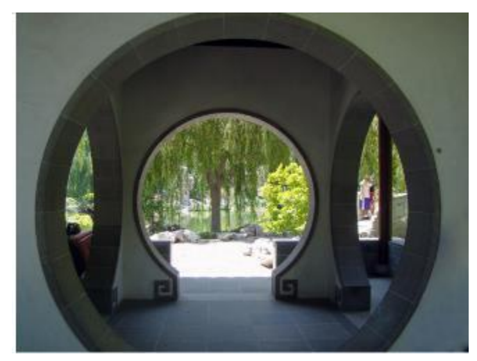
1<sup>st</sup> Place Architecture Key Hole Susan Phelps, TUGNET